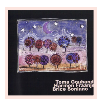
Par 4 Chemins