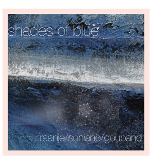
Shades of Blue